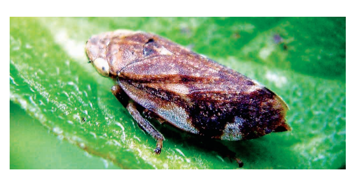
Adult spittlebug.

If you see something that you think could be a spittlebug, we would like to know about it. Either use the Find-A-Pest reporting app on your phone to send through a report, or catch it (if you can), snap a picture of it, and report it us at KVH on 0800 665 825 or info@kvh.org.nz.