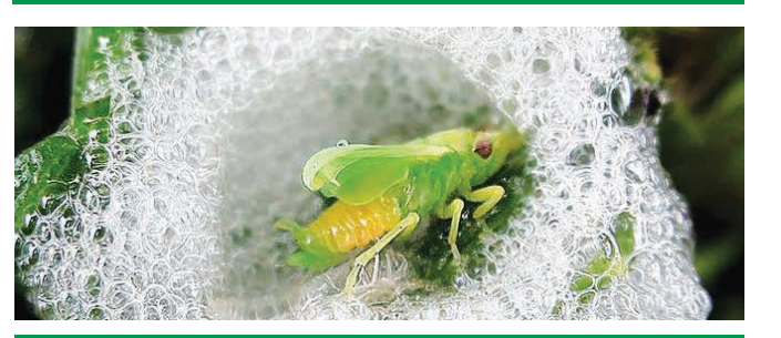
Nymph.