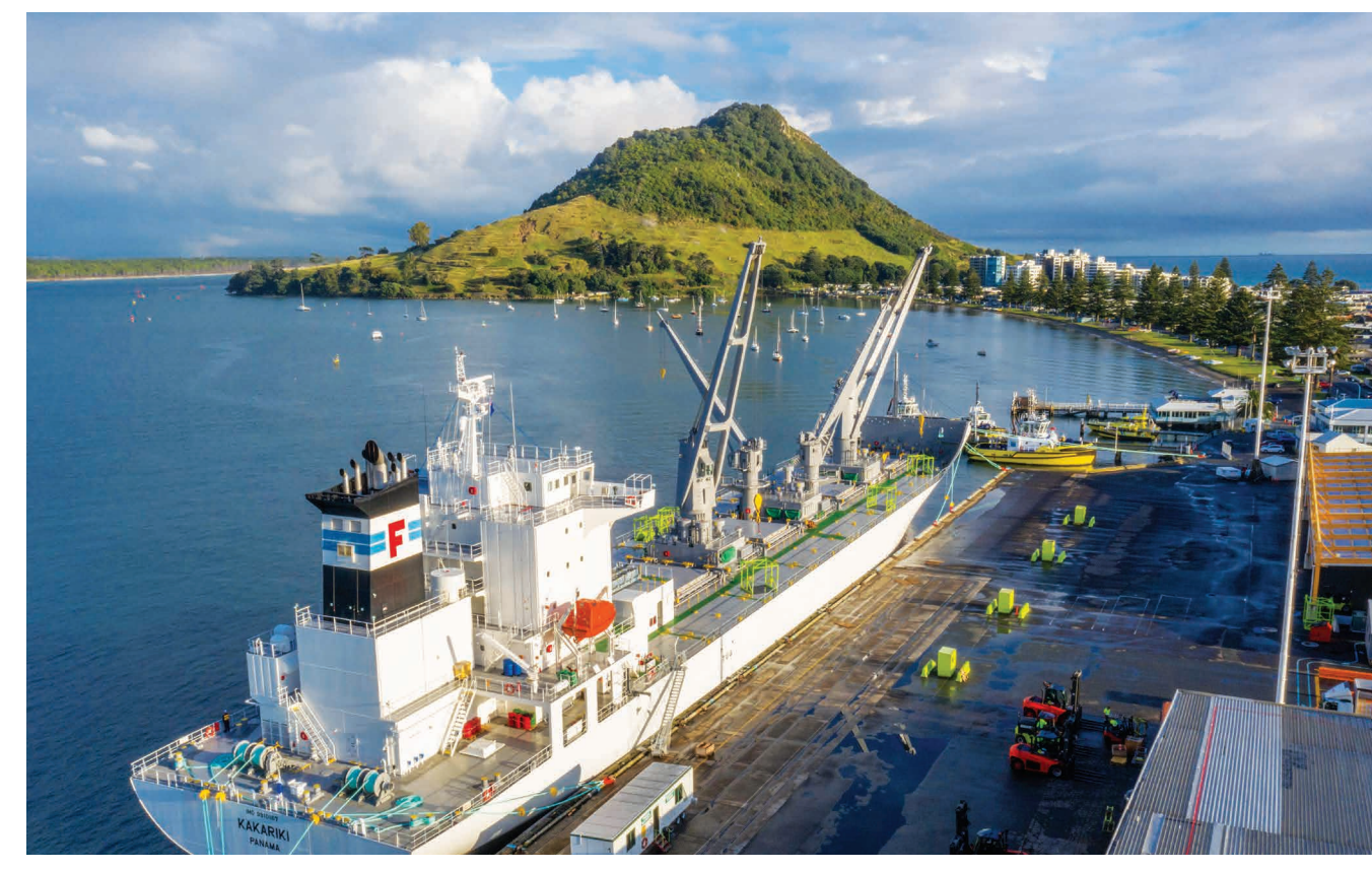
MV Kakariki being loaded with New Zealand-grown Zespri Kiwifruit at the Port of Tauranga.

In mid-March, the first shipment of what is expected to be a record season of New Zealand-grown Zespri Kiwifruit, left the Port of Tauranga, bound for Tokyo and Busan. The fruit set sail on MV Kakariki, the second of three new specialised reefer vessels built by Fresh Carriers to ship New Zealand-grown kiwifruit to Zespri's Asian markets. Kakariki is expected to complete its maiden voyage in early April.