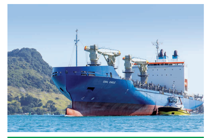
MV Cool Eagle off to Belgium, carrying our great-tasting Zespri Kiwifruit.

MV Cool Eagle is one of a series of five ships that are the largest reefer vessels ever built and will carry more than 8,300 tonnes of fruit, making MV Cool Eagle the largest vessel to carry Zespri Kiwifruit to date. The vessel will discharge her cargo of fresh Zespri SunGold Kiwifruit